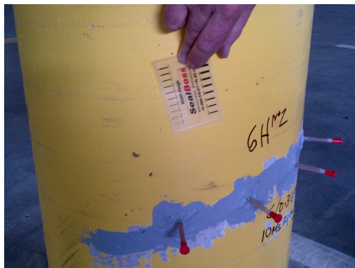
Figure 1. Measuring Crack Width

Repair Method: Equus Southern submitted SealBoss® 4000LV and SealBoss® 4000 QuickSeal for the structural injection of these cracks. Through a process of low pressure chemical injection, Canterbury Waterproofing Limited successfully injected hundreds of structural cracks and structures throughout the casino. Through strict Quality Control guidelines of material volume documentation, the team was able to present quantitative injection results to engineers.