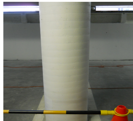
Figure 4. Completed Beam