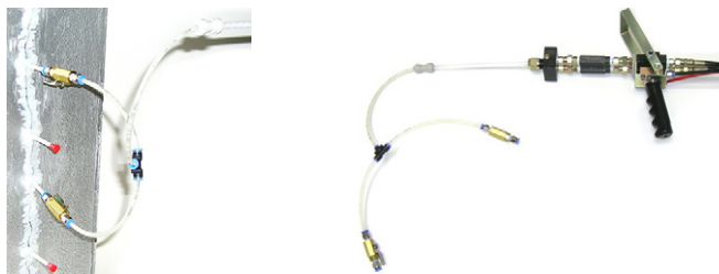
Applicator with Static Mixer & Split-Set (optional)

The PA 5000 Epoxy Injection Machine features a large air cylinder for pressures up to 1000 psi. The higher injection pressures allow for better performance with thicker resins and with all materials at lower temperatures. The tanks are unitized and mounted on four easy roll caster wheels with breaks. The machine is very mobile. The pump is available in 2:1 or 1:1 mixing ratio versions. With purchase of a separate piston/cylinder unit mixing ratios can be easily interchanged. This machine is not designed for paste and putty materials that do not flow. Please call our sales office for specific information in regards to materials and temperature ranges.