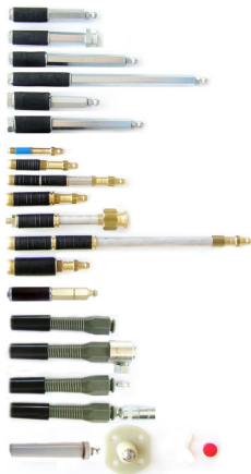
Hose extension with valve and packers sold separately