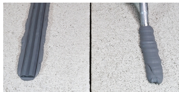
SwellTape™ embedded in SwellCaulk™

Ship in accordance with all applicable laws. Refer to SDS for more information. Store unopened in dry area for up to 12 months from date of production at temperatures between 45°F and 85°F for best performance. See shelf life details on the material packaging.