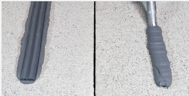
SwellTape™ embedded in SwellCaulk™