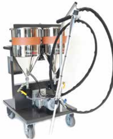
JointMaster Pro2 G3i Digital Two Component Pump

We supply pneumatic, electric & hand operated application guns